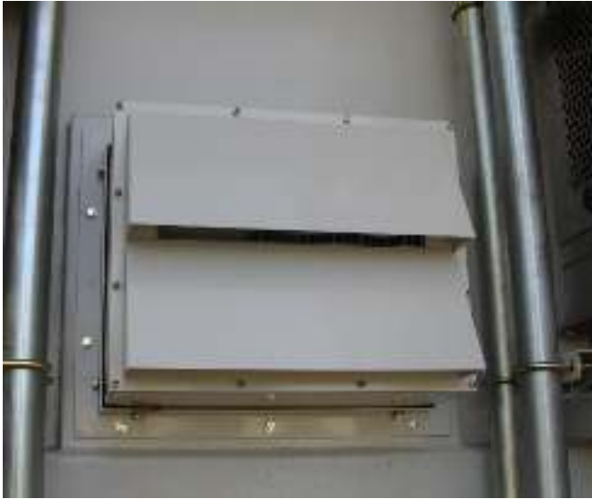
Fig. 3 Typical Outlet Cowl

Detection of failure of the pressurization system is allowed by either monitoring the discharge end of the fan or the room pressure under the IEC. NFPA only recognises the detection at the discharge end of the fan and DNV requires that two pressure switches monitor the pressure in the room. This disparity of monitoring makes a single solution more difficult. Room pressure should be the governing measure as it is, after all, the sole priority of the system. The dual redundancy of the DNV requirements seems arduous considering the fault tolerances specified according to the protection type. Precedence, however, is set by the requirement in IEC 60079-2 for two pressure sensors when dealing with static pressurization of enclosures.