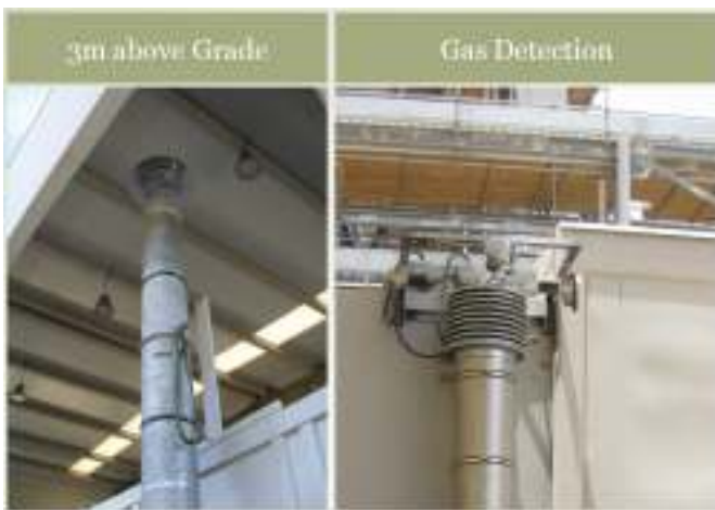
Fig. 2 Inlet Options

EN prohibits the location of pressurization fans internal to the room and for v2 or any internal source of release requires two fans (Dual Redundant) . IEC makes no reference to the location of the fans; neither does it require dual redundancy for any of its protection concepts. EN specifies the ventilation flow must be achieved with 50% of the flaps closed and that for v2 and v3 flow will be monitored at inlet and for v4 at the outlet. IEC requires that if an outlet valve is fitted then flow shall be verified there and places the constraint that if a dedicated outlet valve is not used then verification shall be by gas detection. This clause effectively defines the requirement for a dedicated outlet for any system that employs purging.